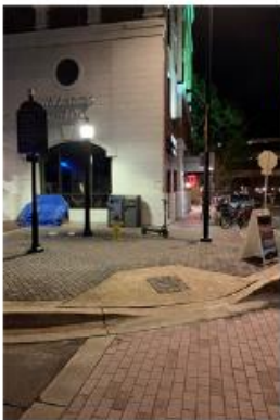
Busk Stop 1: SE 1st St & SE 2nd Ave