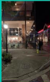
Busk Stop 2: SE 2nd Pl & 1st St.