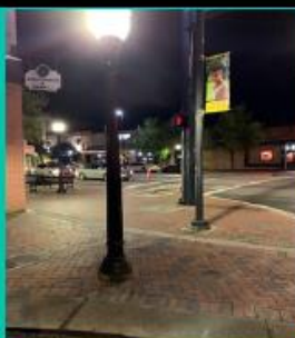
Busk Stop 3: Main Street & SE 1st Ave