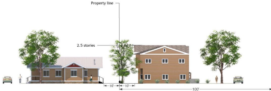
Figure 1: Height Compatibility Pitched Roof Example