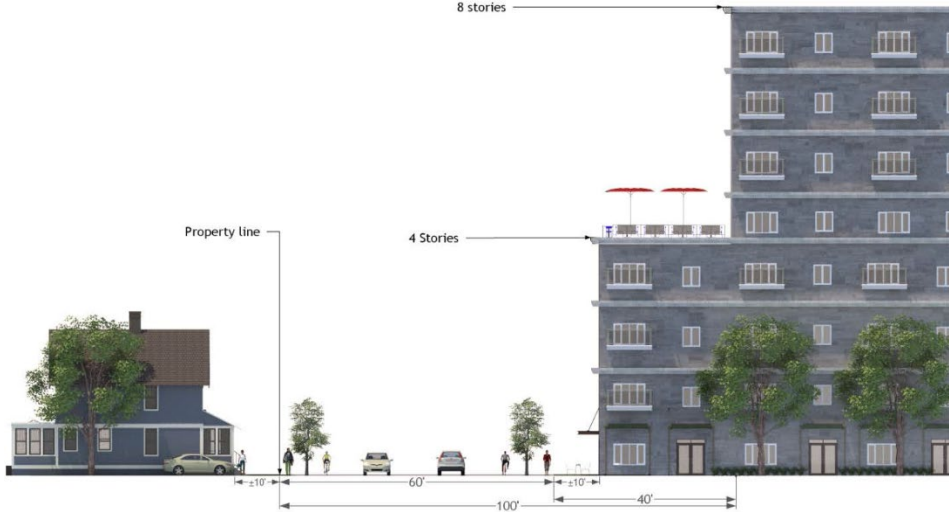
Figure 2: Height Compatibility University Heights