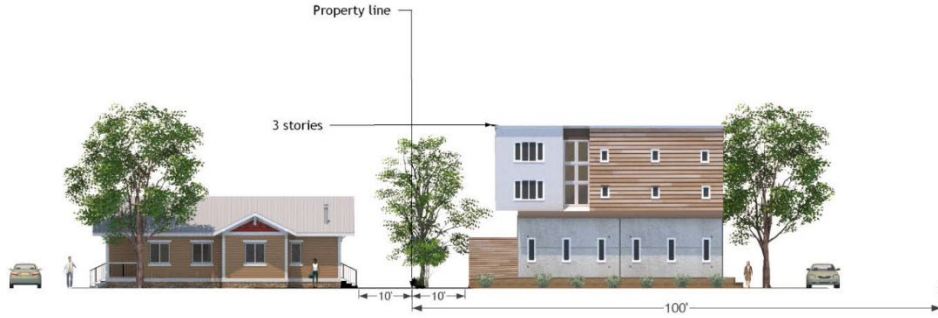
Figure 2: Height Compatibility Flat Roof Example