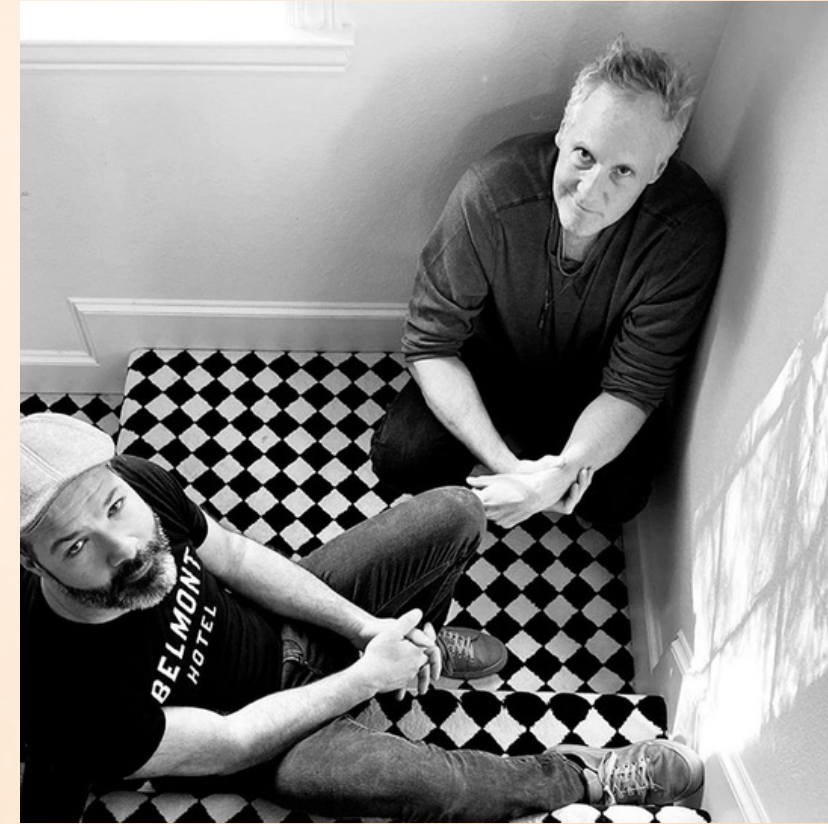
Speaker Wars with STAN LYNCH*

*In the Rock and Roll Hall of Fame The original drummer for Tom Petty & the Heartbreaks