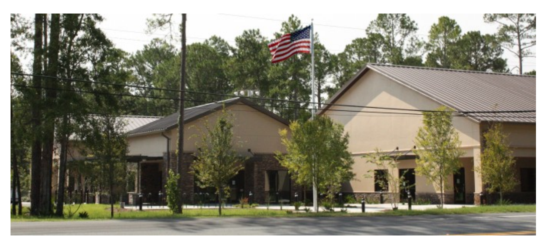
City of Gainesville/Alachua County Senior Recreation Center

Go to the online calendar at: <u>http://eldercare.ufandshands.org/</u> for up-to-date information.