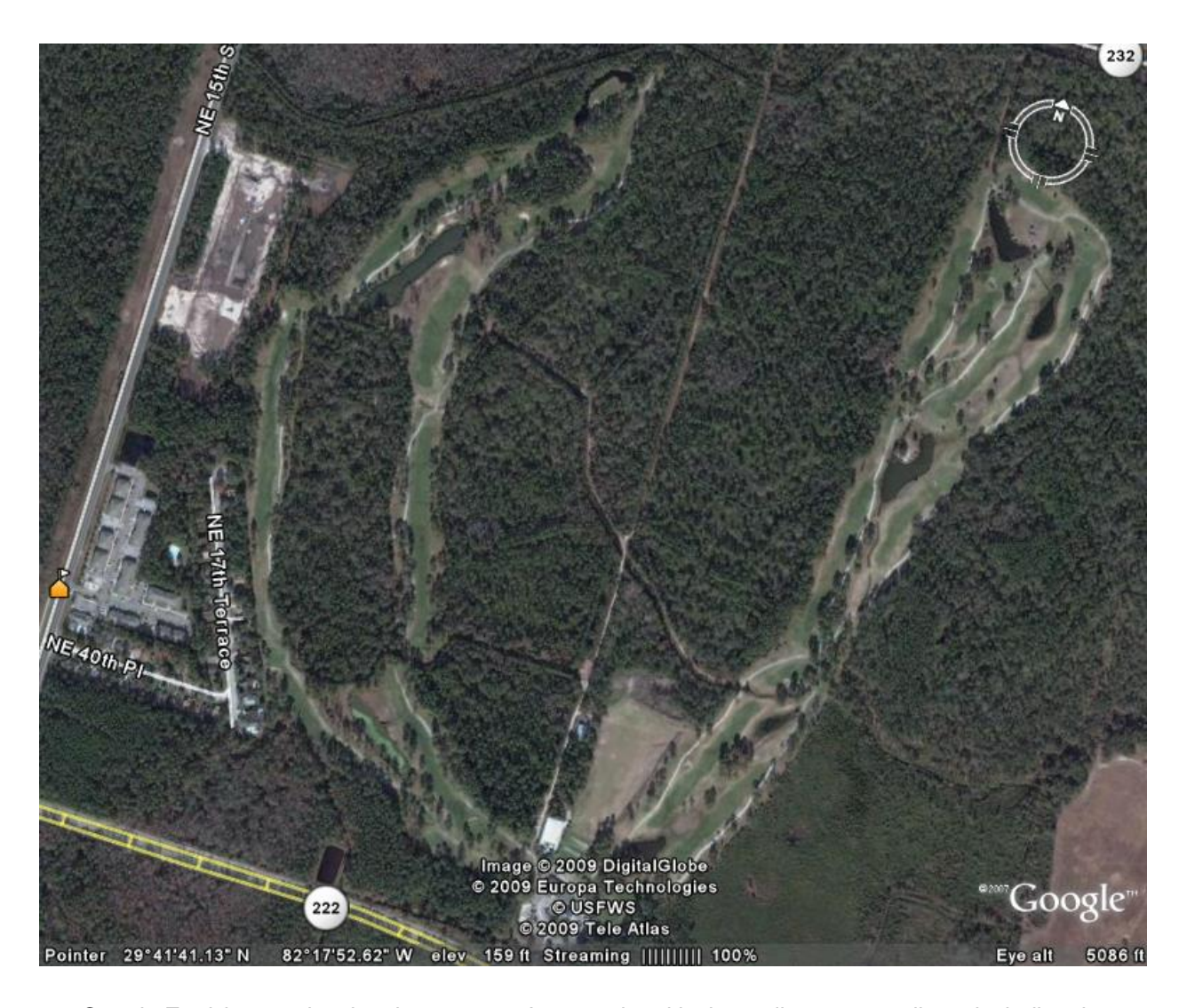
Google Earth image showing the 138-acre Ironwood and its immediate surroundings, including the surrounding open space that could be considered for possible re-development. We note the large footprint of the site and the limited piece that is Ironwood.