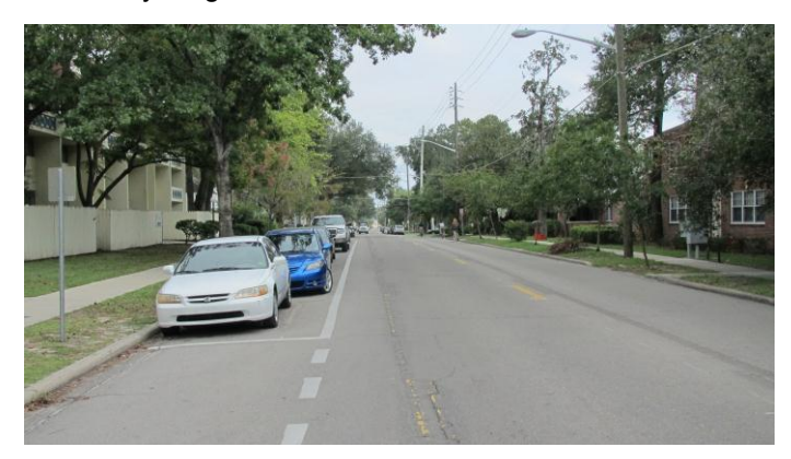
Figure 9. Potential areas for new on-street parking created with signage and striping (in red)

Figure 8. New parking created through the elimination of a turn-lane on SW 4<sup>th</sup> Avenue in University Heights