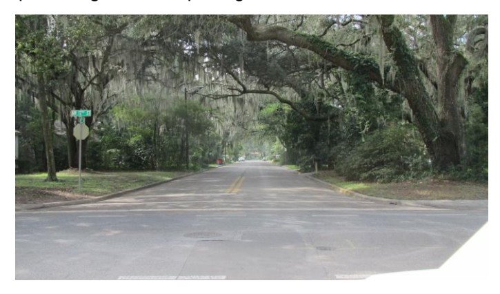
Figure 4. Multi-family development has largely replaced single family homes along the 1100 block of SW 9<sup>th</sup> Road in University Heights.

Figure 3. Limited use of on-street parking during the work day along the 1700 block of NW 6<sup>th</sup> Avenue in College Park. The permit program has continued to be successful in preventing commuter parking in areas like this that have remained largely single-family.