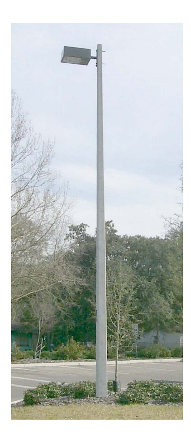
Light Type L15