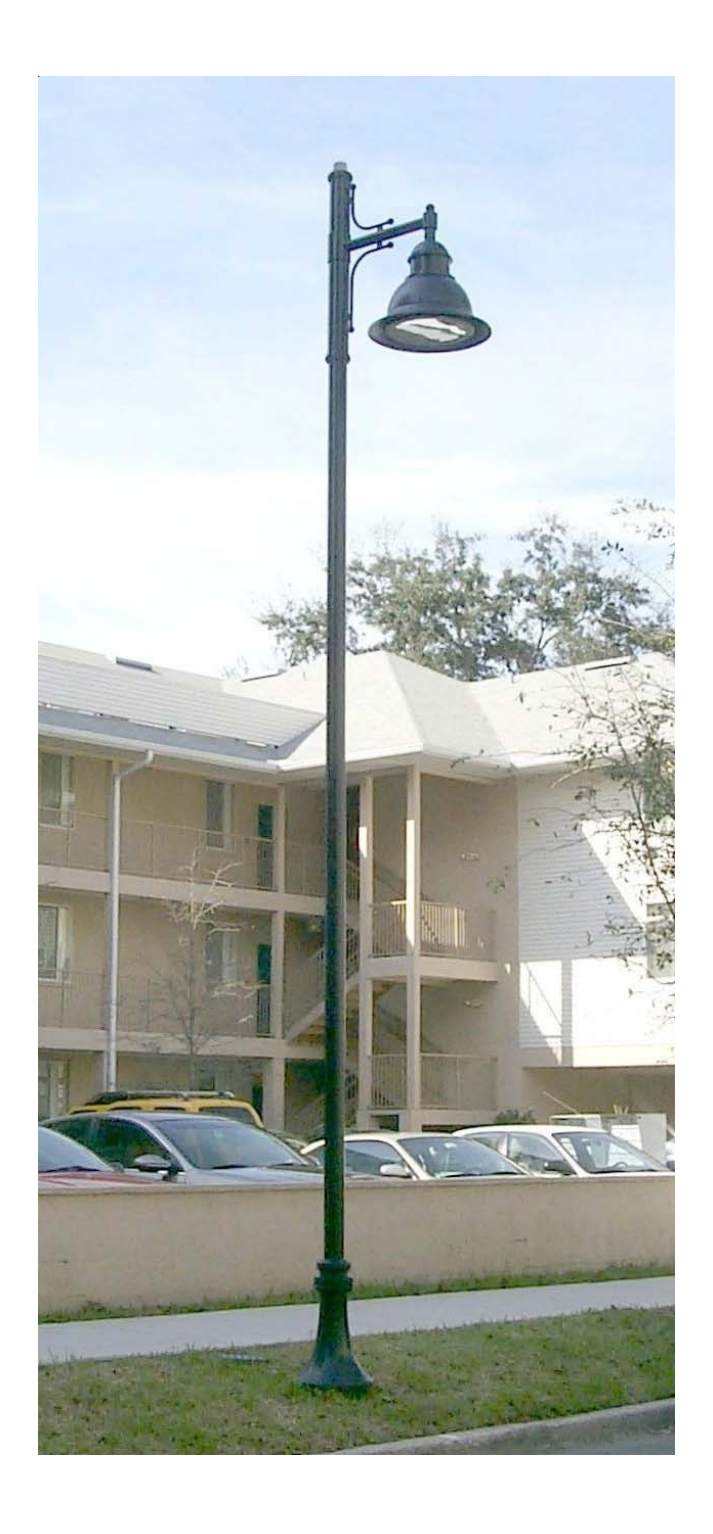
Light Type L27