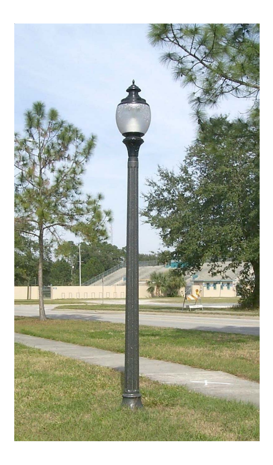
Light Types L29 and L30