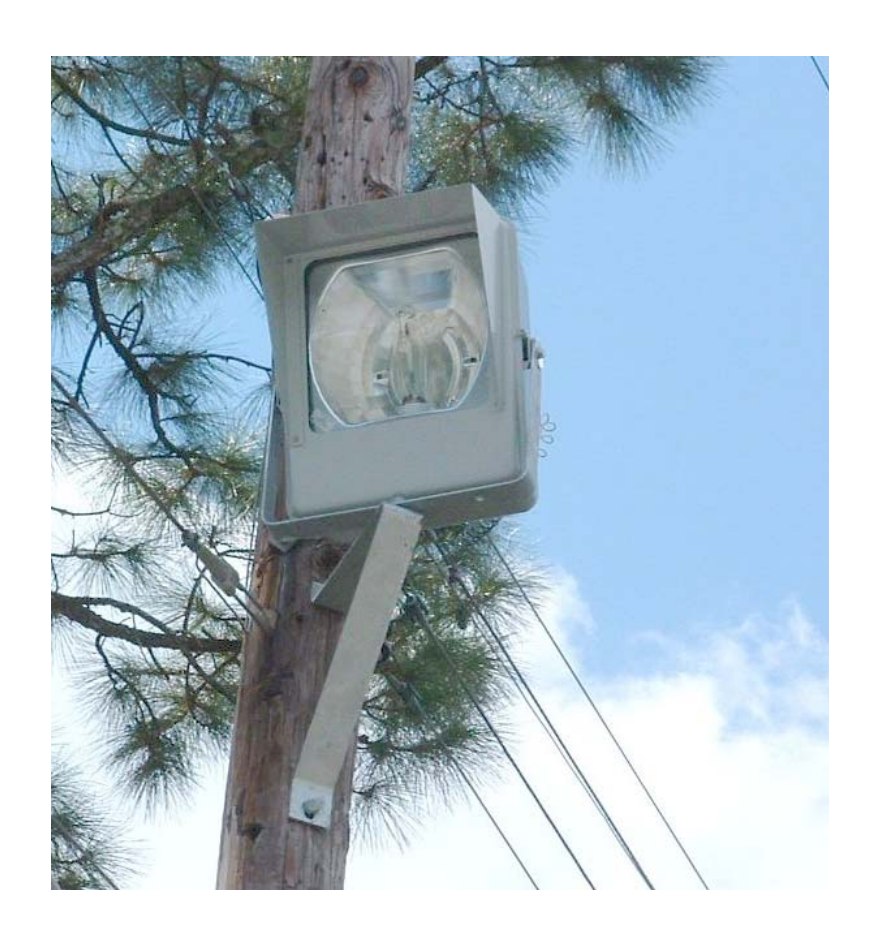
Light Types L10, L12, and L22