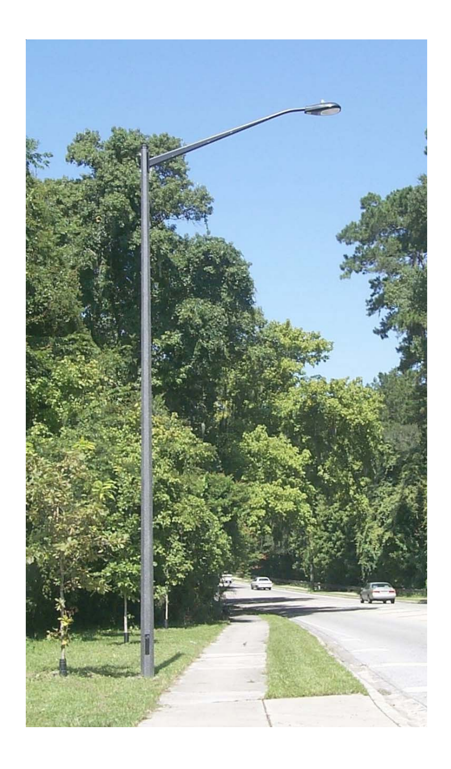
Light Types L24, L31 and L32