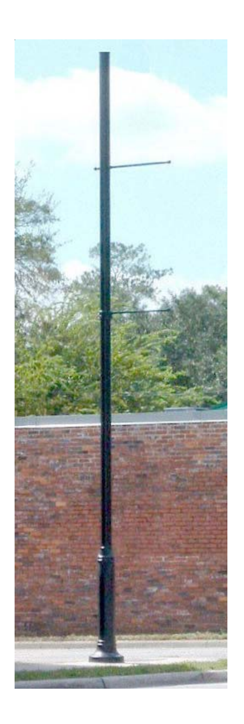
Pole Type P5