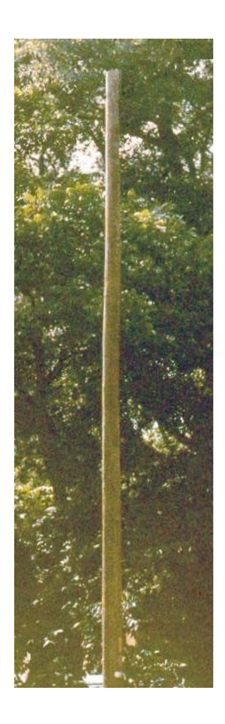
Poles P8, P12, P15, and P18