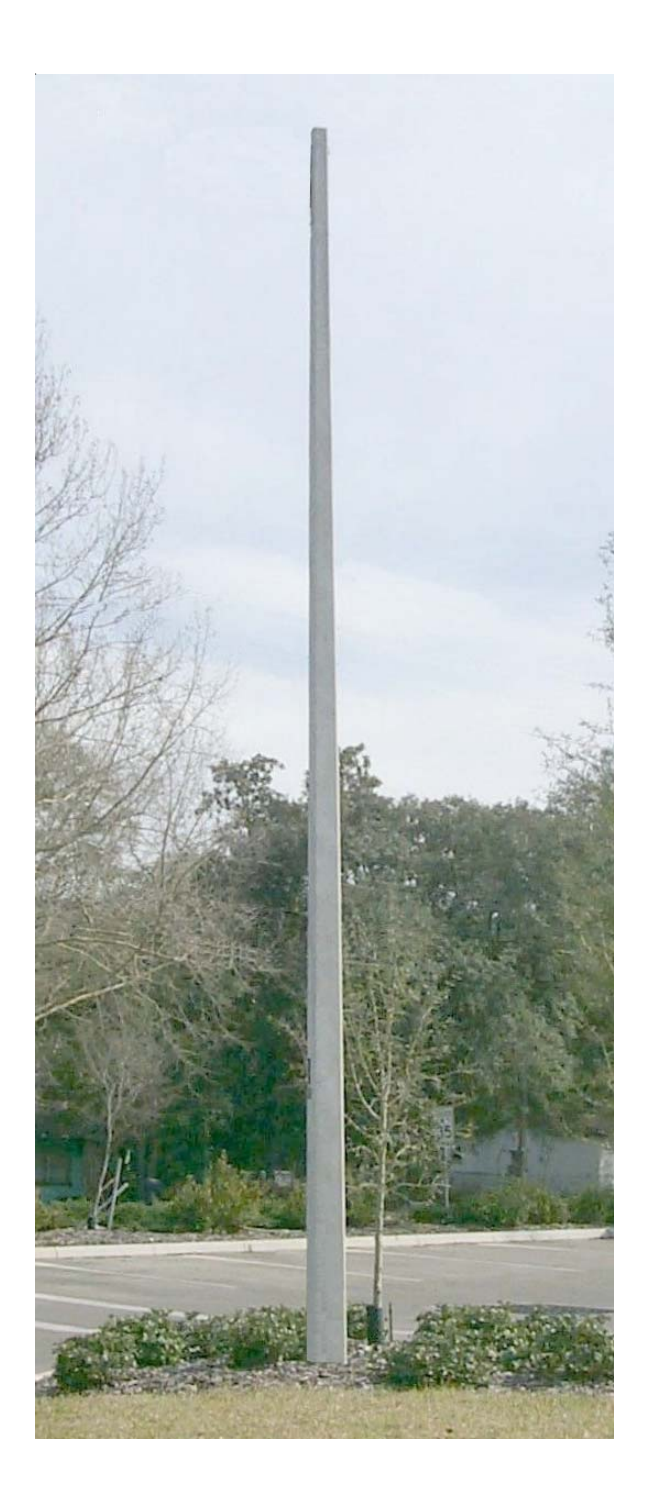
Pole Type P1