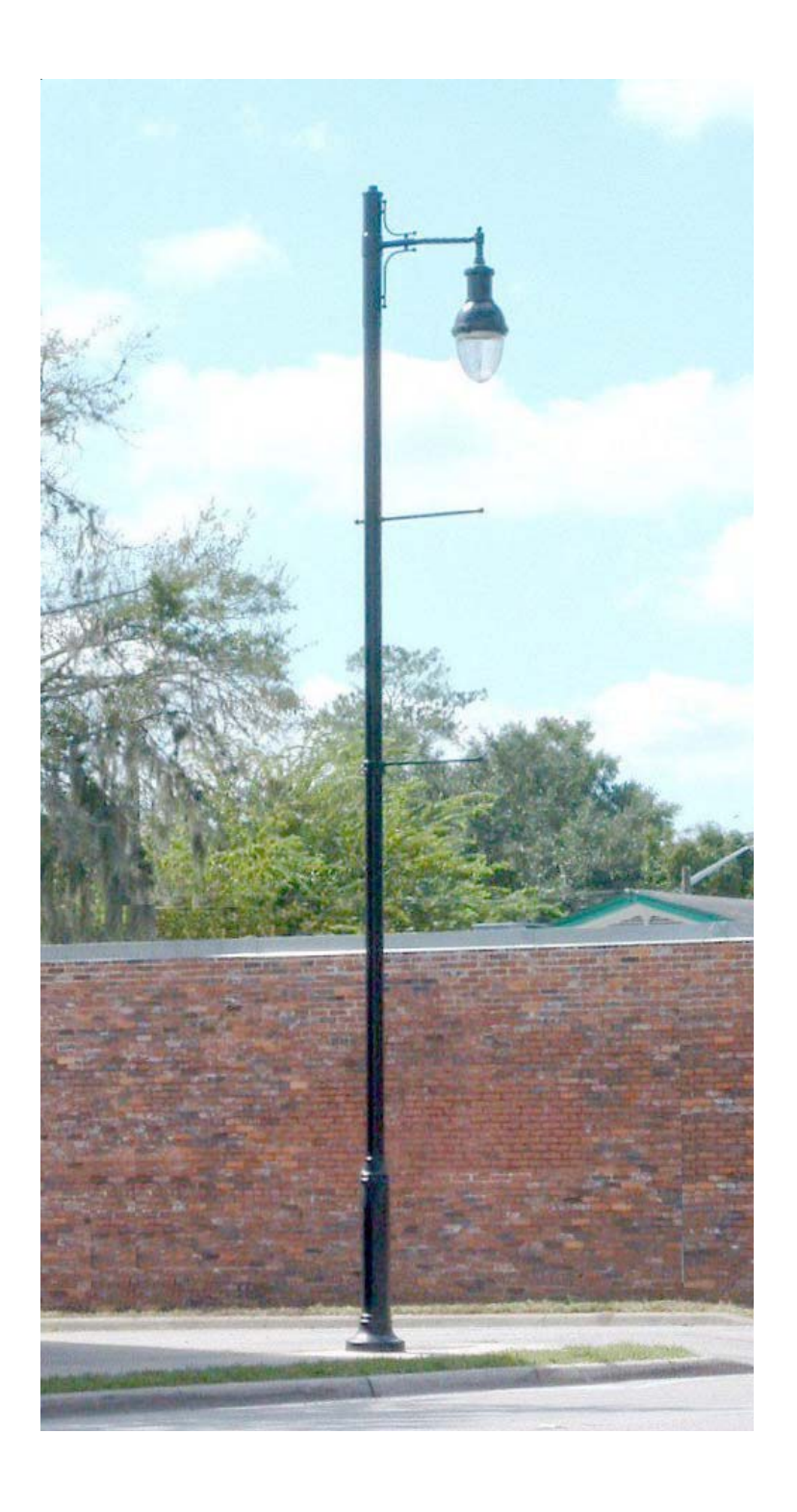
Light Types L33 and L34