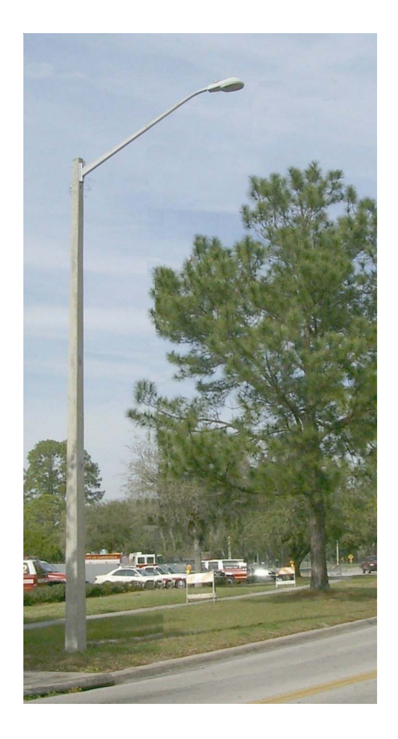
Light Types L11, L14, L16 and L23