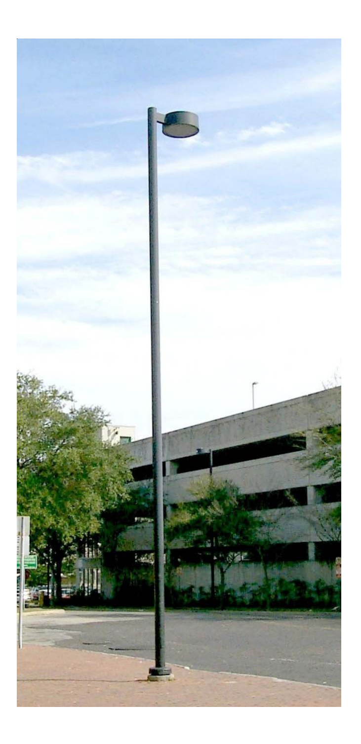
Light Type L17