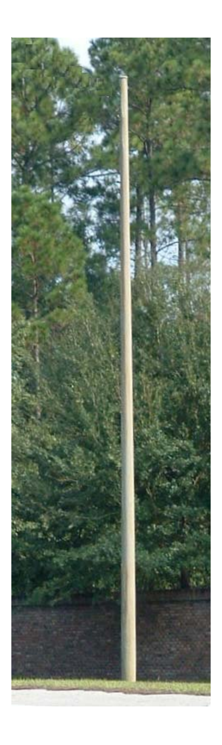
Pole Type P10