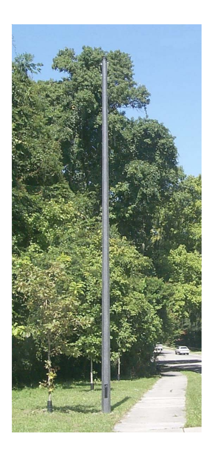
Pole Type P14 and P17