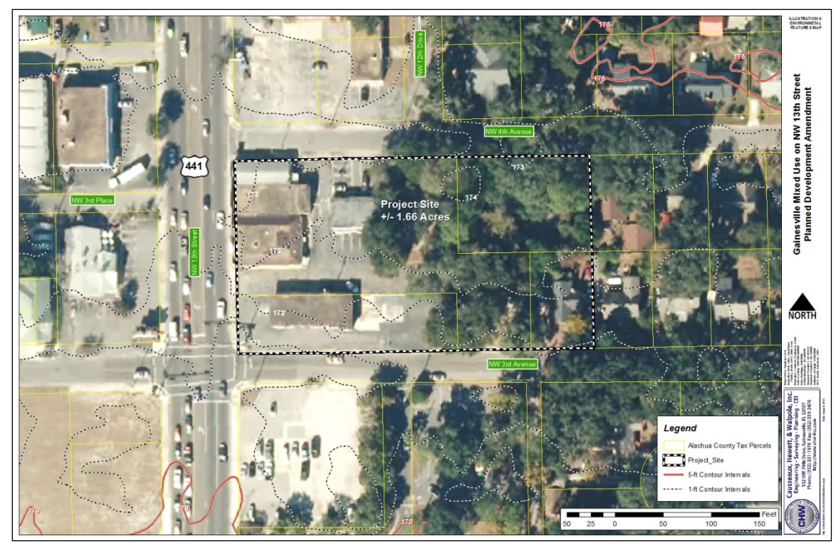
Map 5: Topography, Wetlands, & FEMA Floodplain Map

According to the National Resources Conservation Service (NRCS), the soil types onsite are Urban Land and Millhopper-Urban Land Complex, 0- 5 % Slopes (See Map 6). These soils are suitable for both urban-type residential and non-residential development.