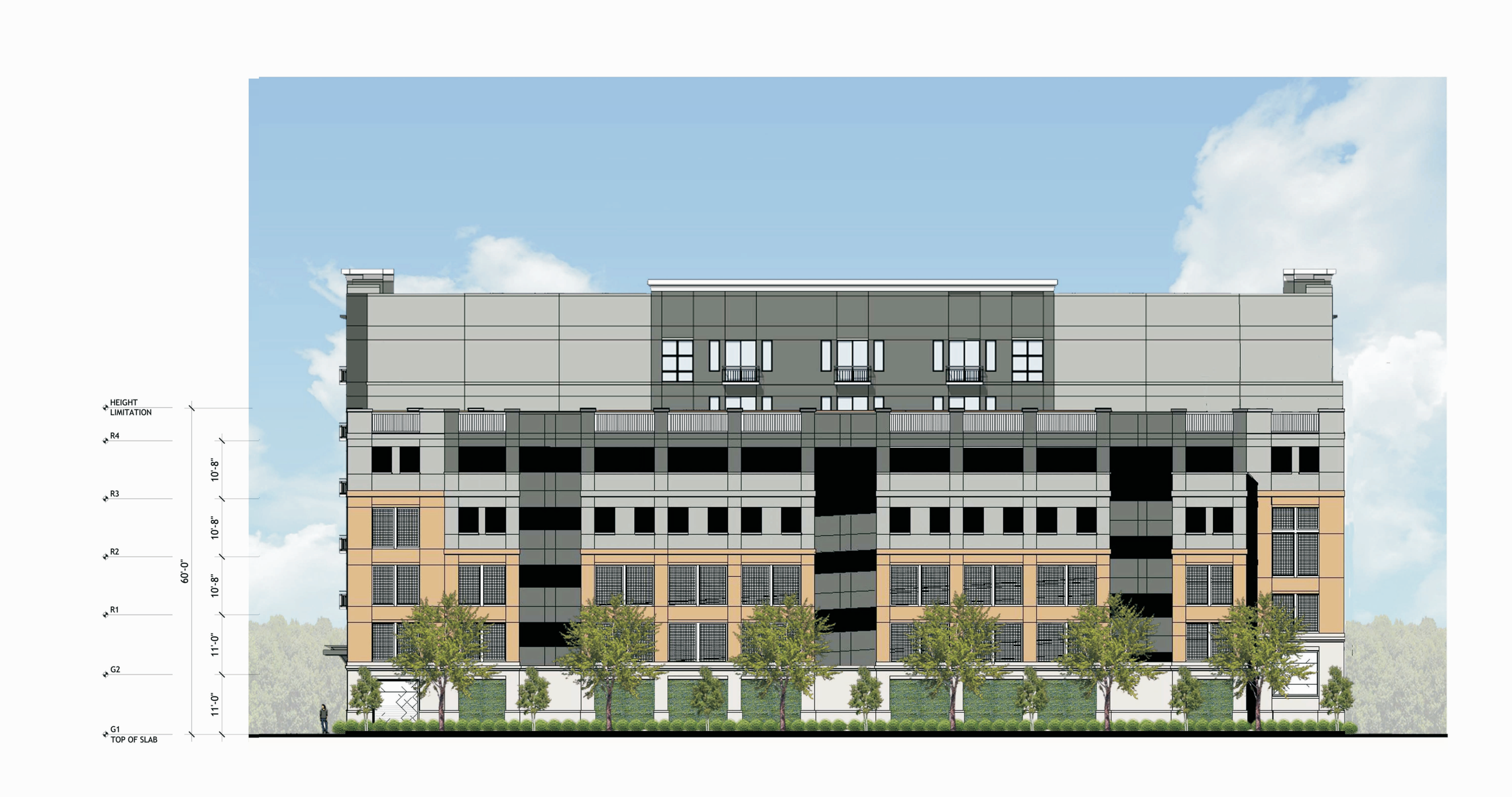
View From East

Mixed Use Development Gainesville. Florida