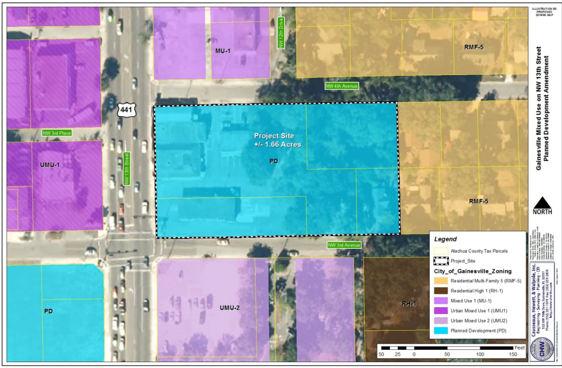
Map 4: Proposed Zoning Map

designations that all allow building heights of five (5) to eight (8) stories and a wide mixture of uses.