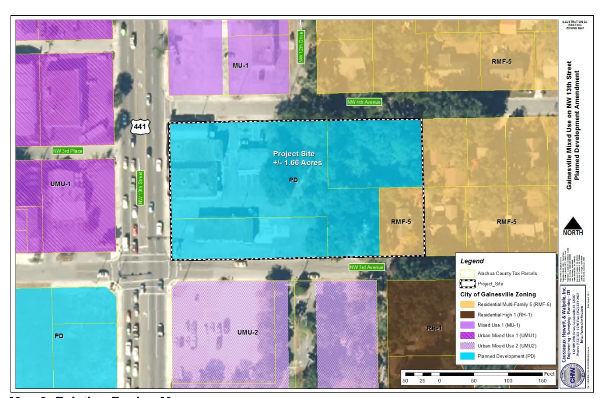
Map 3. Existing Zoning Map

Through this application, the zoning for Tax Parcel 14021-000-000 will be changed from RMF-5 to PD. An accompanying small-scale comprehensive plan amendment application will change the FLU from Residential Low Density to PUD. The existing and proposed zoning designations are shown in Maps 3 and 4. Table 1 also identifies the FLU and zoning designations for properties surrounding the PD site.