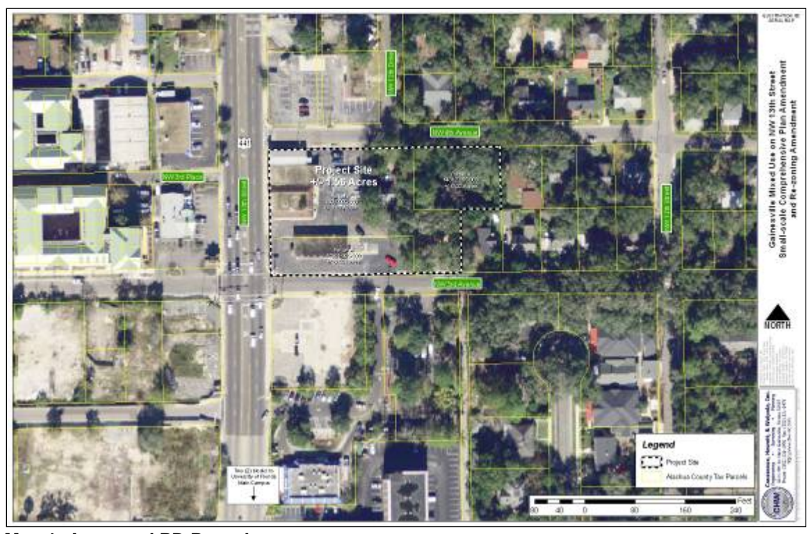
Map 1: Approved PD Boundary

As shown in Map 1, the approved PD consists of three tax parcels: 14012-000-000, 14038-000-000, and 14044-000-000.