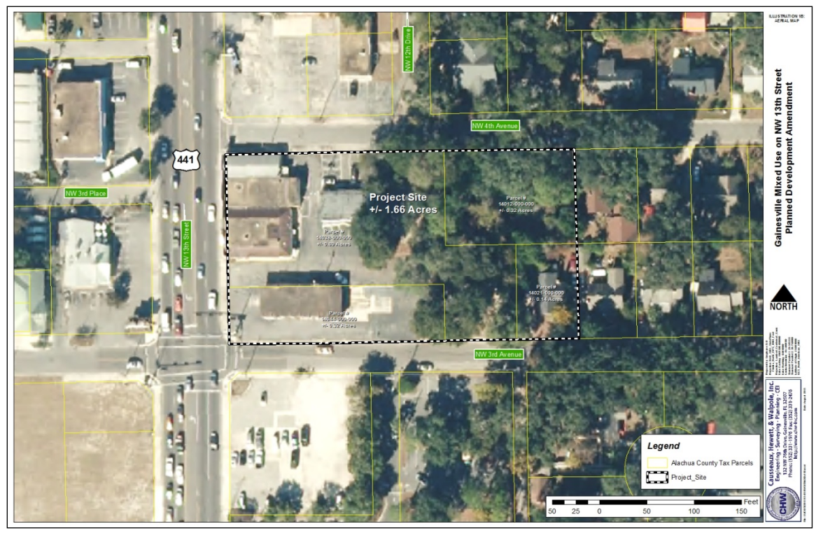
Map 2. Proposed PD Boundary

The proposed PD amendment will add tax parcel 14021-000-000 and increase the overall PD size by 0.14 acres. The proposed PD boundary is shown on Map 2.