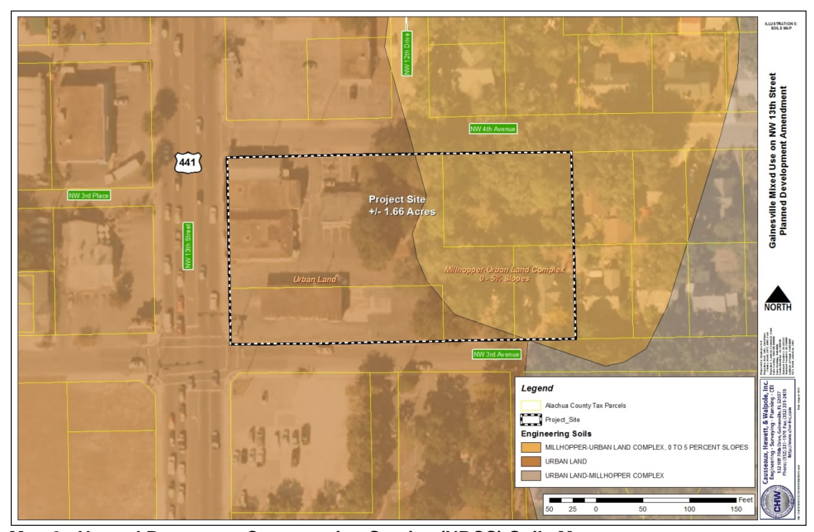
Map 6: Natural Resources Conservation Service (NRCS) Soils Map

According to the National Resources Conservation Service (NRCS), the soil types onsite are Urban Land and Millhopper-Urban Land Complex, 0- 5 % Slopes (See Map 6). These soils are suitable for both urban-type residential and non-residential development.