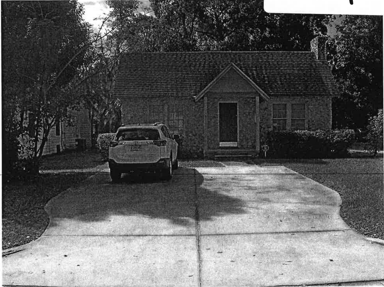
1021 FRONT OF BLDG. TO BE RELOCATED ON SITE