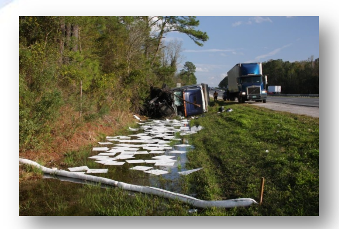
Hazardous Materials Management