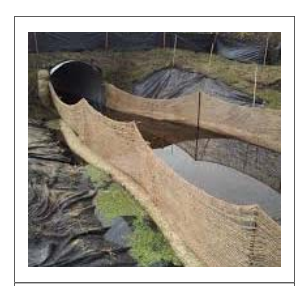
Paynes Prairie restoration