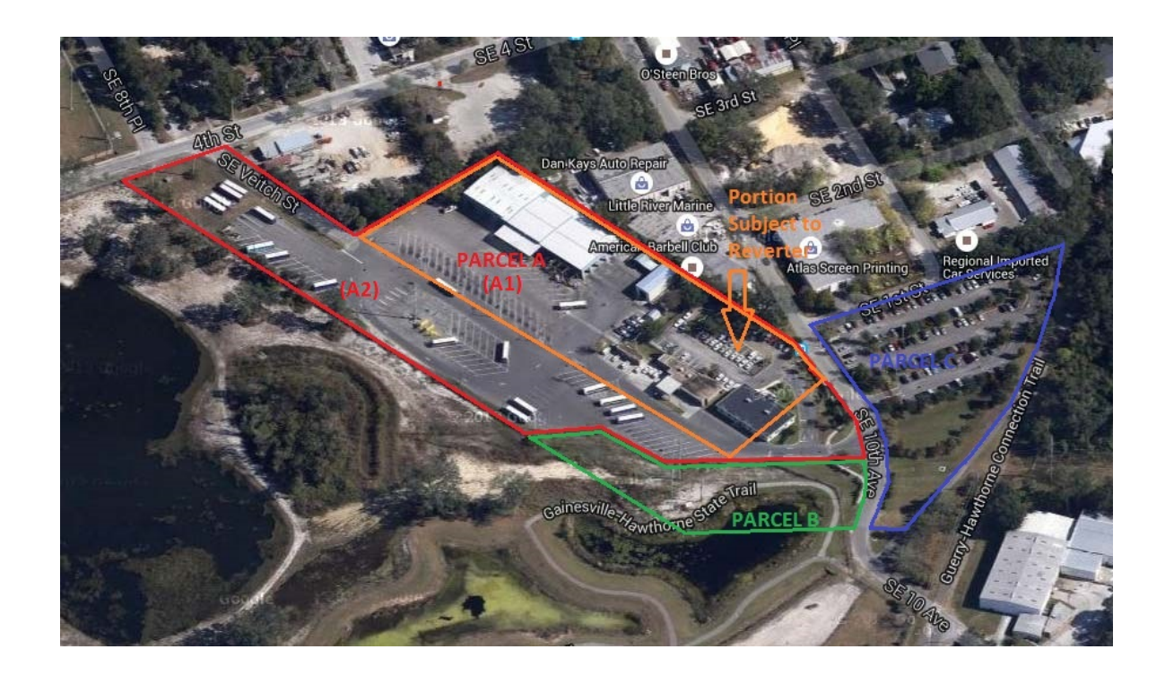
Figure 1. - RTS Original Facility

Parcel A1 (3.18 acres) was obtained by deed from Alachua County which originally obtained the property using FTA grant funds.