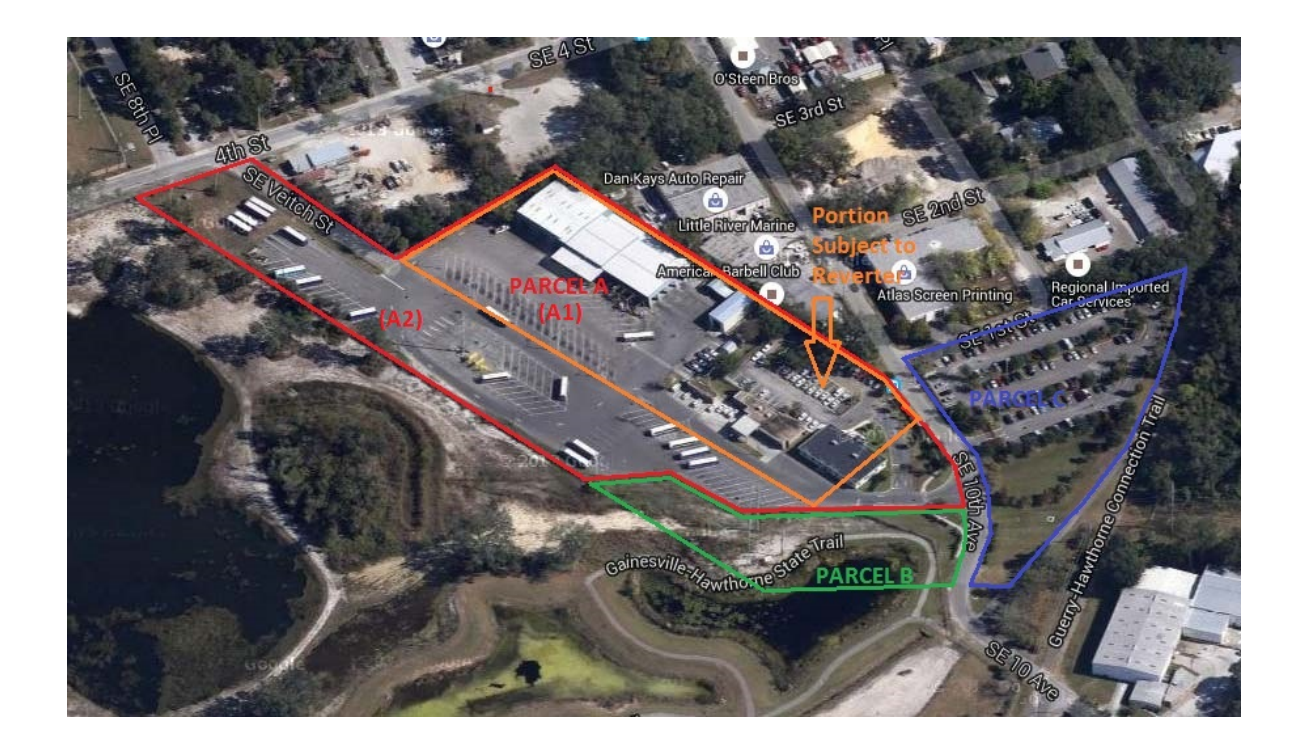
Figure 1. - RTS Original Facility

Parcel A1 was obtained by deed from Alachua County which originally obtained the property using FTA grant funds.