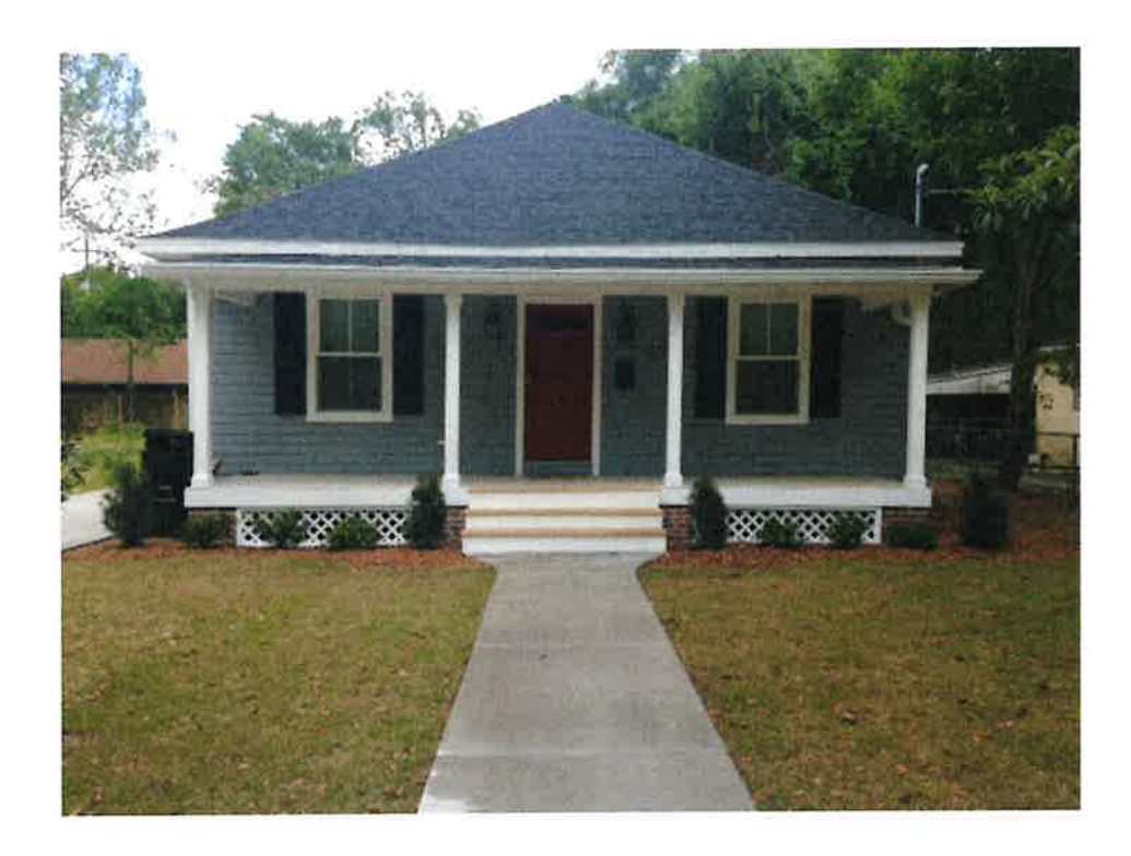
Exhibit 2 - Photos