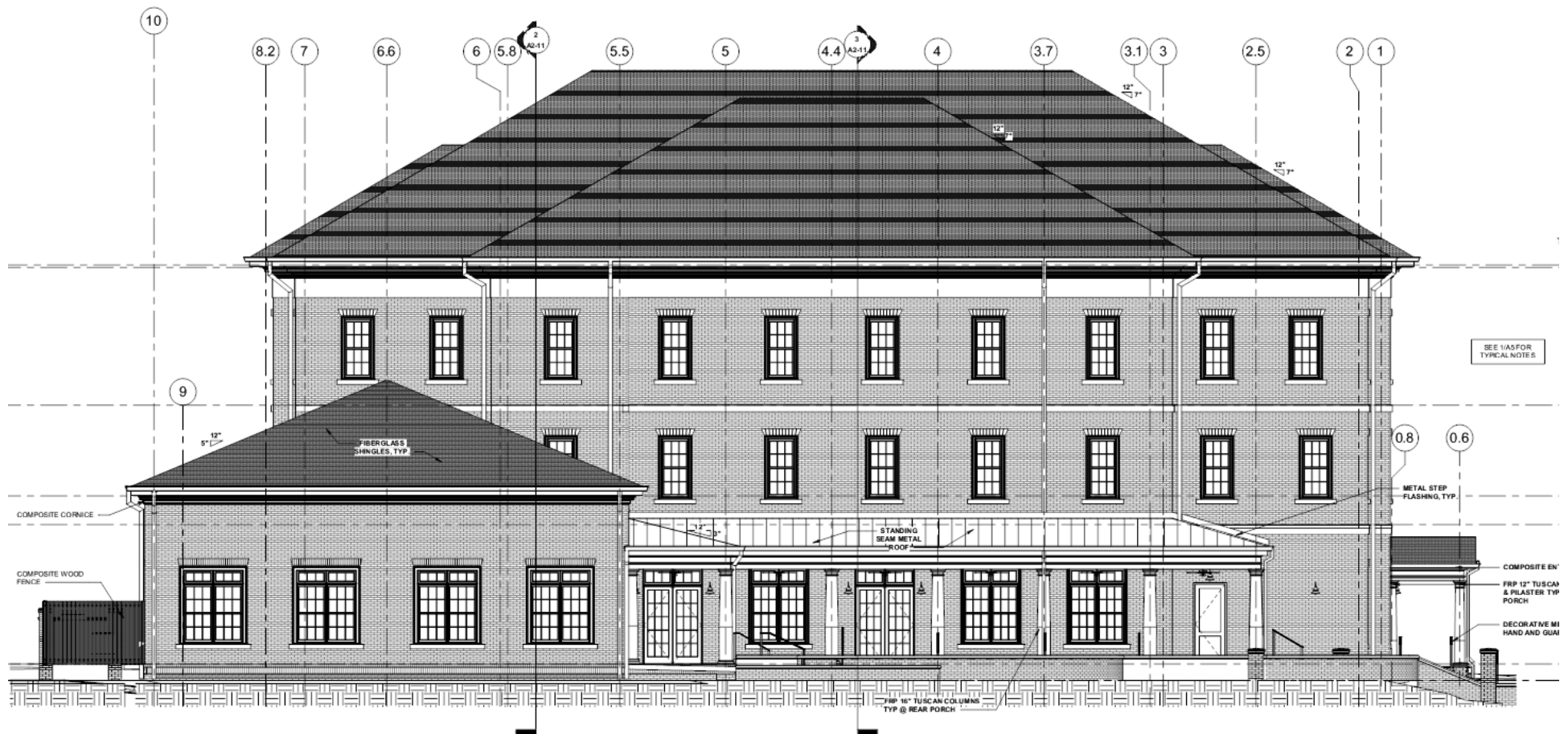
1 SOUTH ELEVATION A203 SCALE 3/16" = 1'-0"