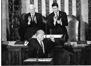
President Donald Trump, center, flanked by Vice President Mike Pence, left, and House Speaker Paul Ryan of Wis., gestures Tuesday on Capitol Hill in Washington, before his address to a joint session of Congress.

"We are getting organized, getting prepared,"