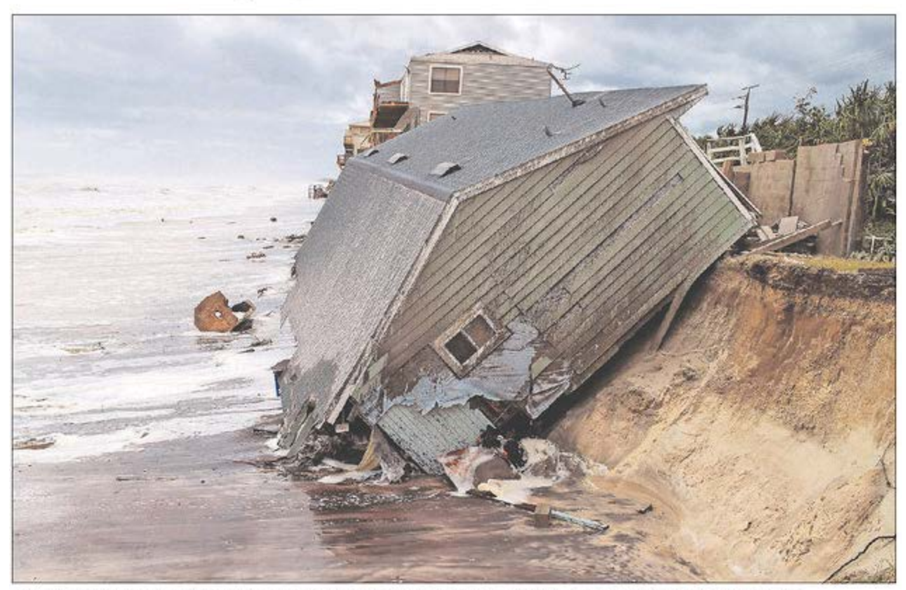
A house slides into the Atlantic Ocean in the aftermath of Hurricane Irma in Ponte Vedra Beach, Monday

Irma swamps Jacksonville; dozens rescued