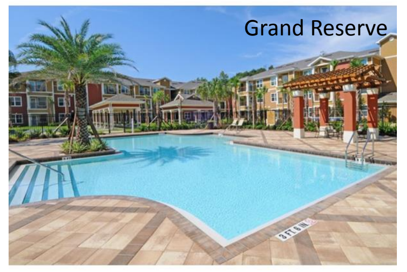
160 Unit Affordable Project Zephyrhills, FL 97% Average Occupancy

195 Unit Affordable Project Gainesville, FL 95% Average Occupancy