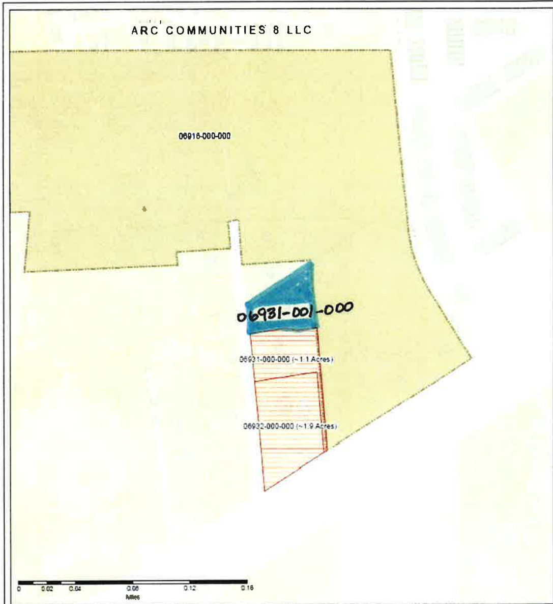
Proposed Annexation : Properties North of Archer Road City of Gainesville, Florida

Tax Parcel Numbers 06931-001-000 recognized by the Alachua County Property Appraiser, being more accurately defined on the attached map.