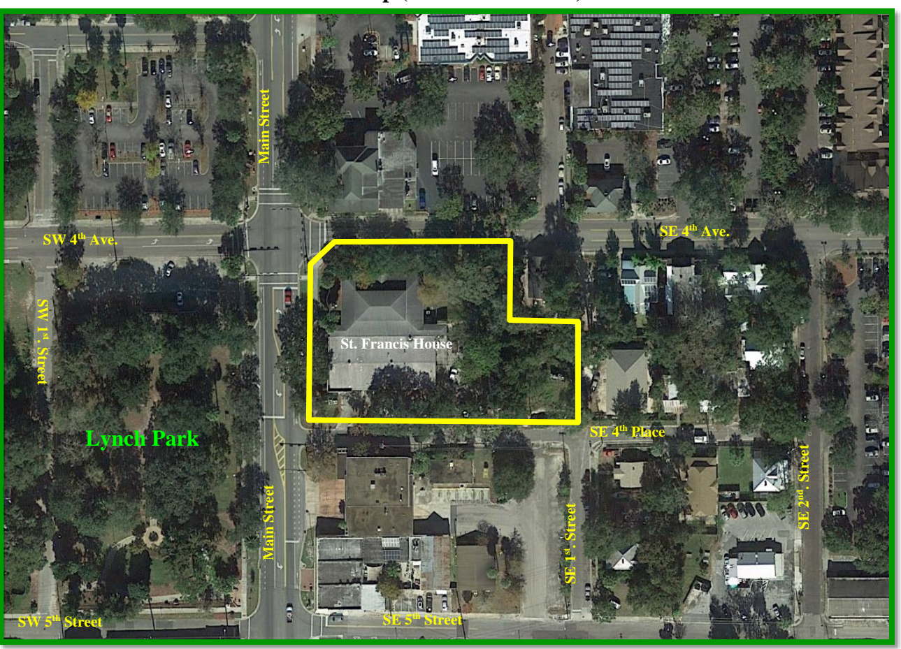
Map 2. Site Map (St. Francis House)