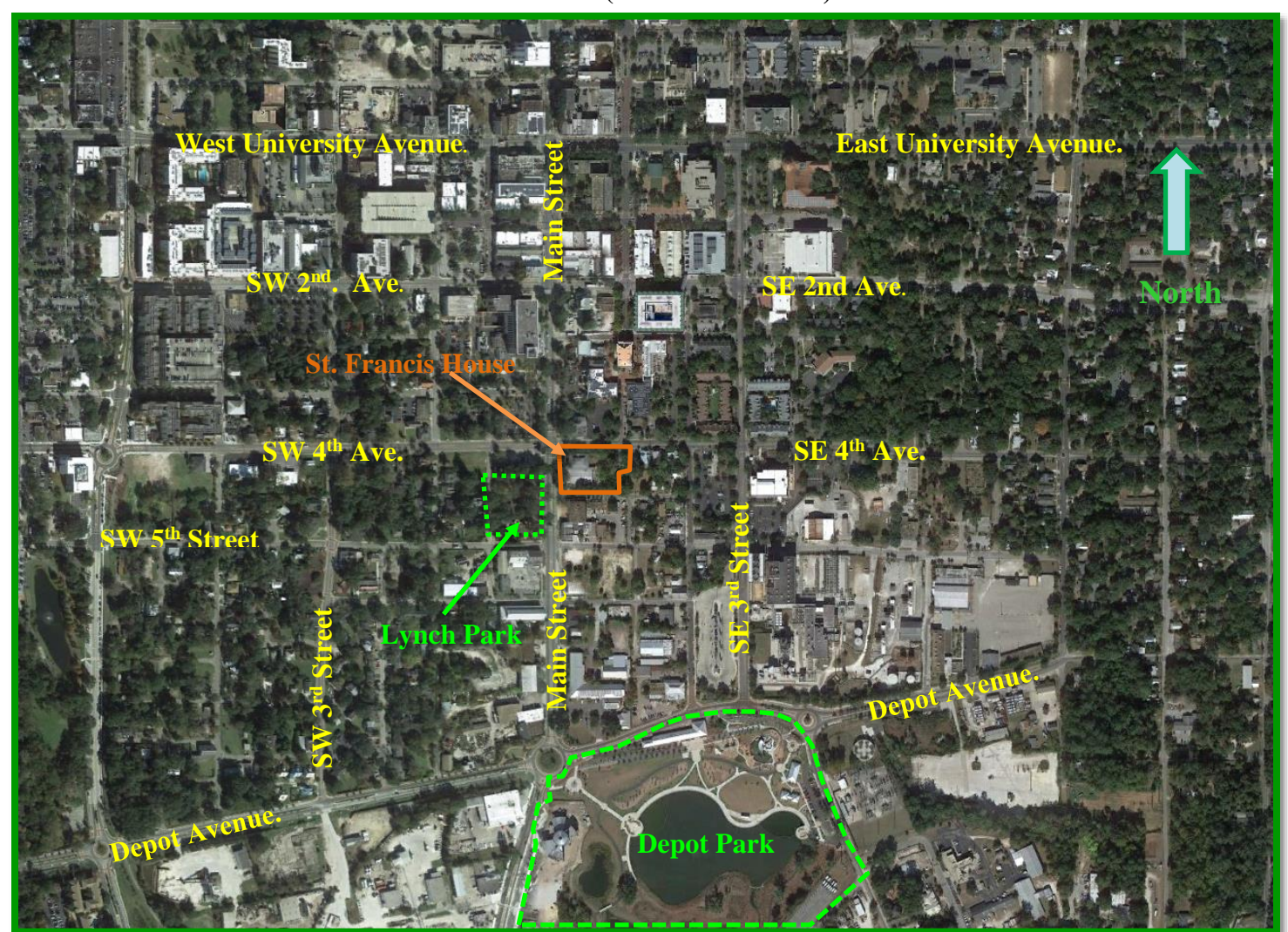
Map 1. General Location (St. Francis House)

Transportation Mobility Program Area (TMPA): Area "A"