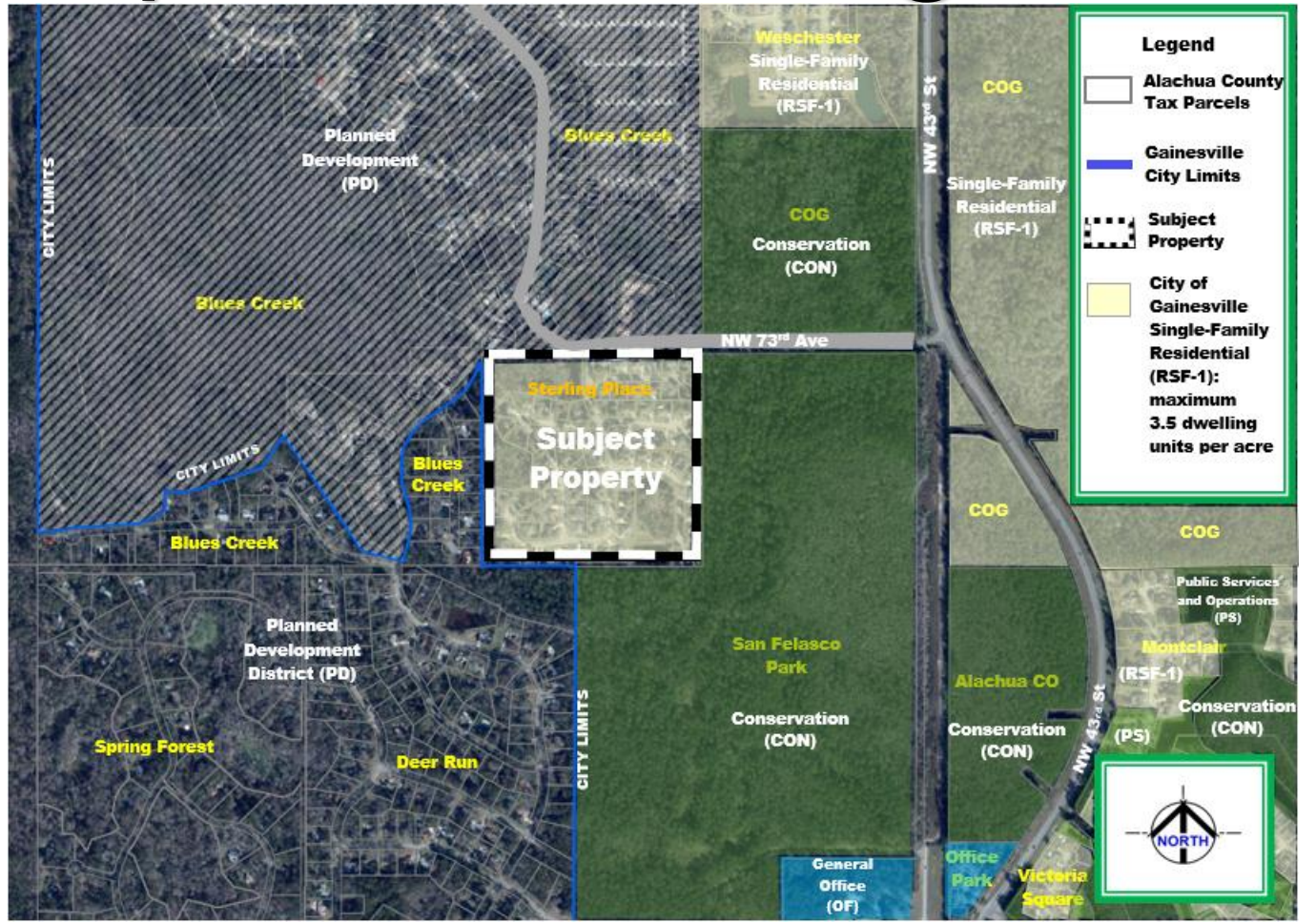
City of Gainesville

Single-Family Residential (RSF-1): maximum 3.5 dwelling units per acre