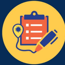
Screen and Test