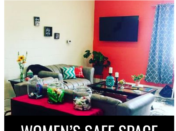
WOMEN'S SAFE SPACE