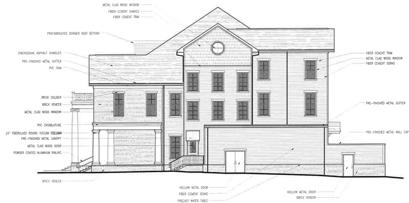
2 SOUTH ELEVATION A2.1 1/8" = 1'-0"

BARGANIER DAVIS WILLIAMS Architects Associated