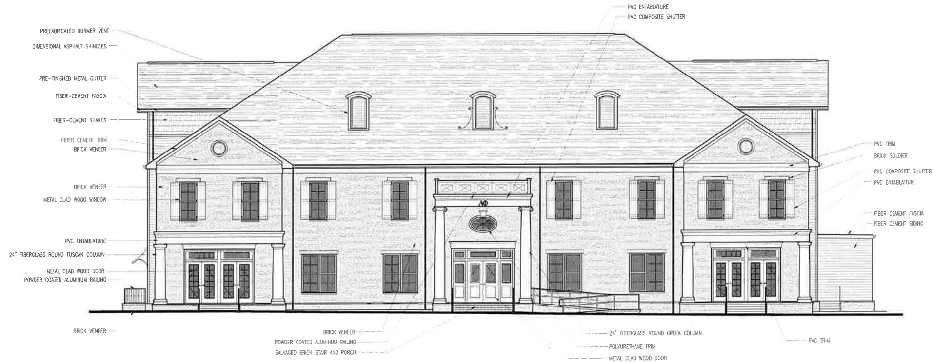
1 WEST ELEVATION A2.1 1/8" = 1'-0"