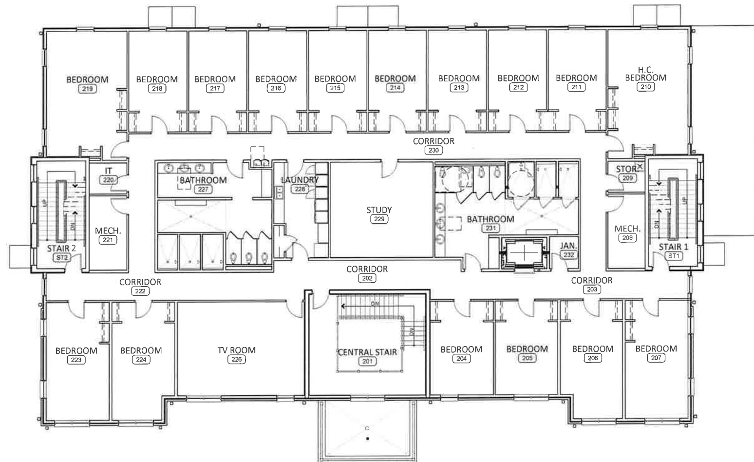
1 SECOND FLOOR PLAN A1.2 1/8" = 1'-0"