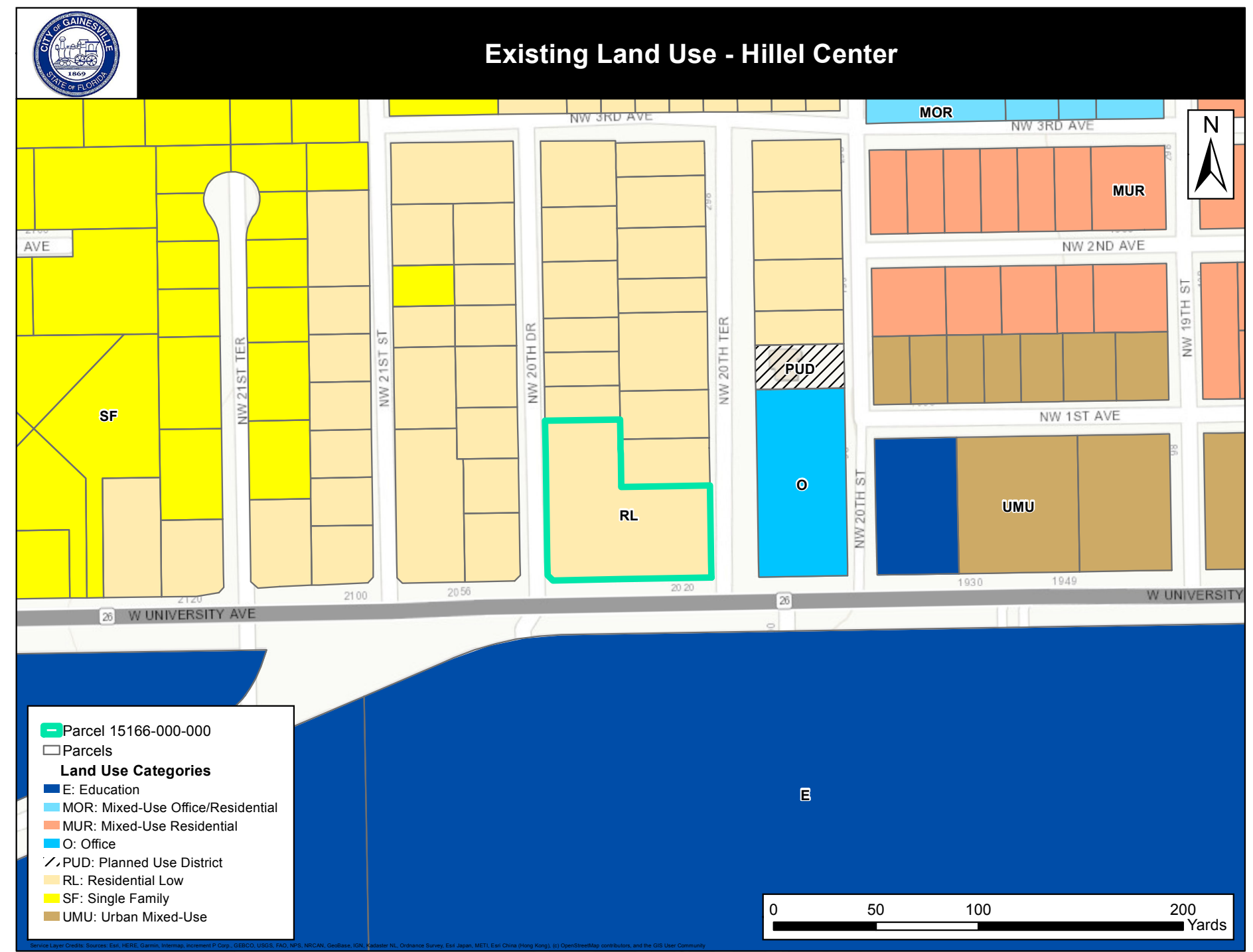
Page 1 of 2