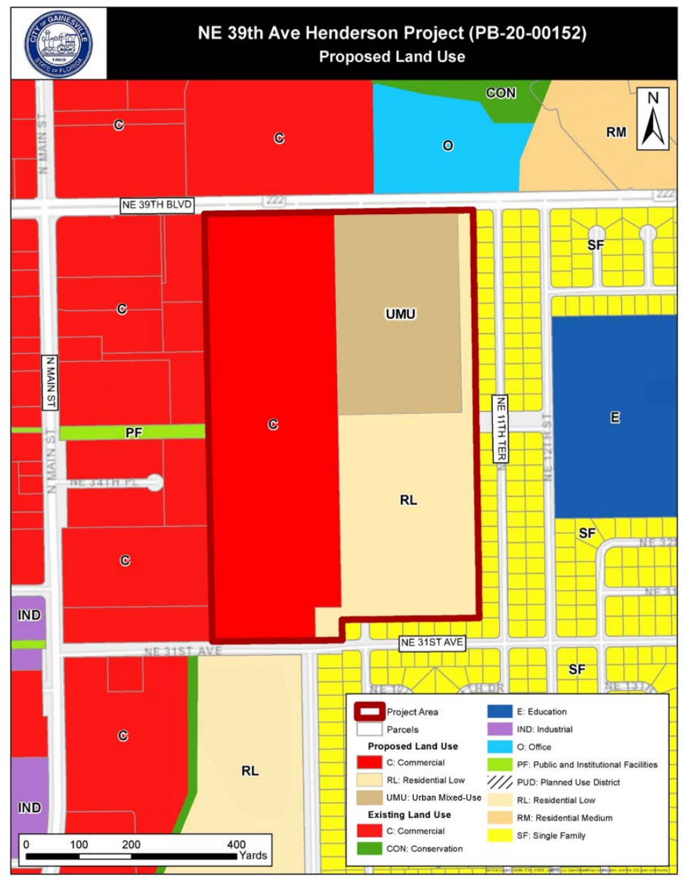
Exhibit B to Ordinance 200886