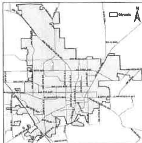
CITY COMMISSION CITY OF GAINESVILLE, FLORIDA

If you have any questions, please contact Gainesville Fire Rescue Administration at (352) 334-6078, Monday through Thursday between 8:00 a.m. and 5:00 p.m.