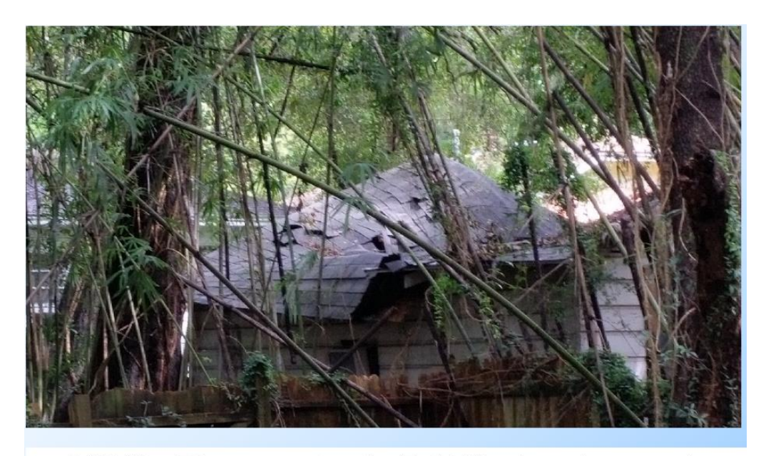
9/13/19 – Photo was taken by <u>Todd Martin</u> and accurately reflected the condition of the property at the time it was taken.

240 SE 6<sup>TH</sup> ST / Tax Parcel No. 12719-000-000 CE-16-02357 / 2017-039