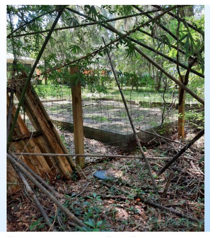
8/11/21 – Photo was taken by <u>Pete Backhaus</u> and accurately reflects the condition of the property at the time it was taken.