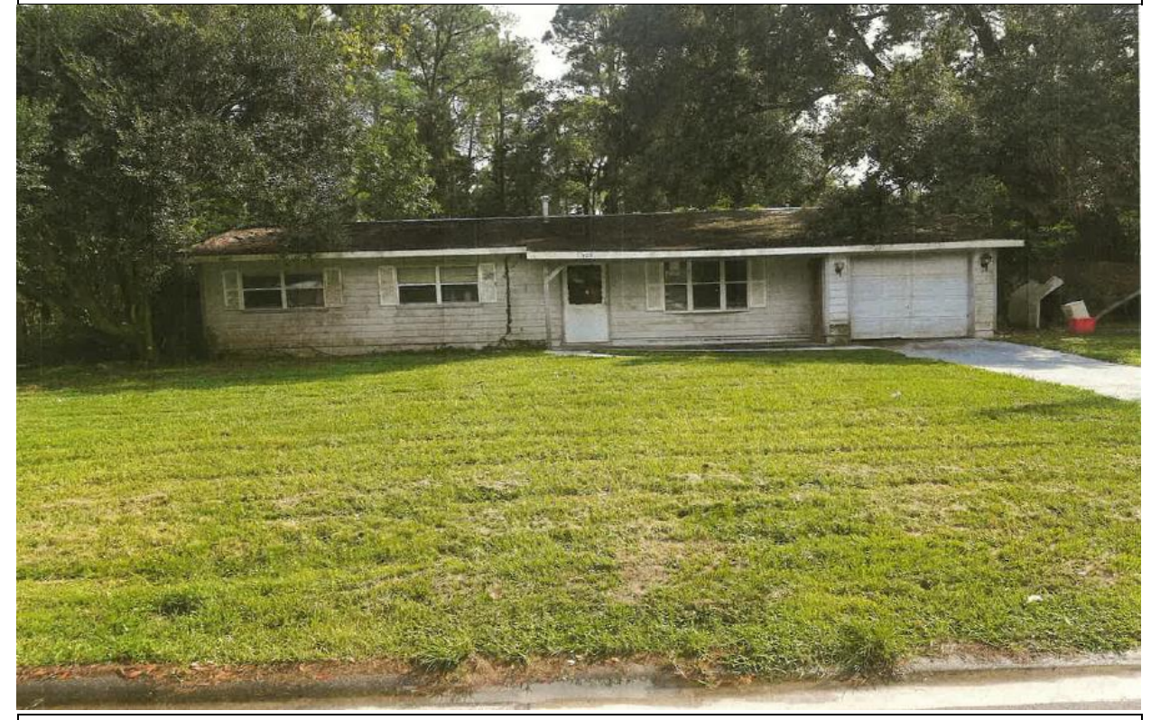
<u>9/8/2021</u> - After Photo taken by Pete Backhaus and accurately reflects the condition of the property at the time it was taken.