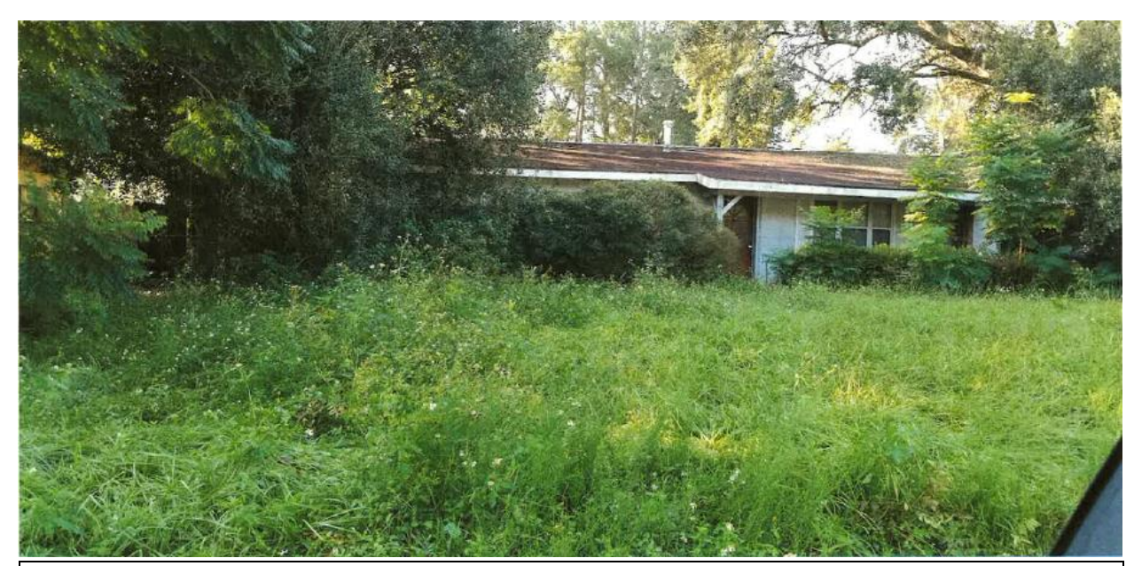
<u>10/15/2020</u> - Before Photo taken by Samantha Norris and accurately reflected the condition of the property at the time it was taken.